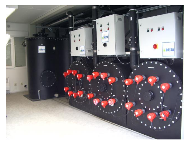
Photolysis reactor for ground water treatment