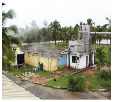
Neutralization of wastewater from textile industry in Sri Lanka