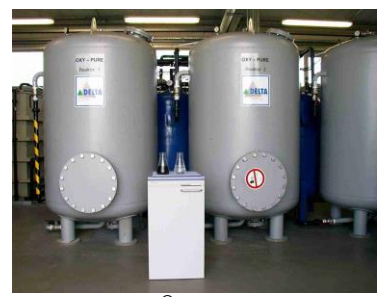
OXY-PURE® for catalytic wet oxidation at the site of a former coking plant in Zwickau (D)

Quality and safety always have the highest priority. In order to guarantee this DELTA Umwelt-Technik GmbH is an accredited specialist under the German Federal Water Act "Wasserhaushaltsgesetz" (WHG) and according to DIN EN ISO 9001:2015.